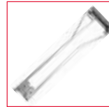
Three-Point Fastener No. 600150003