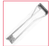
Three-Point Fastener No. 600150003