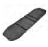
Mattress for F2 Monobloc No. 0314193