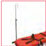
IV Pole No. 0838451