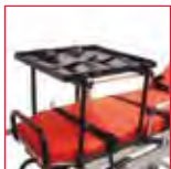
Instrument Tray No. 0832158