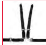
417-1 Restraints No. 0313915 (black) No. 0313914 (orange)