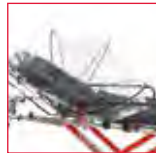
Patient Shield No. 0822097