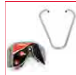
Antler SLAM Fastener F2 Monobloc No. 600253002