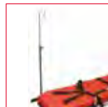
IV Pole No. 0838451